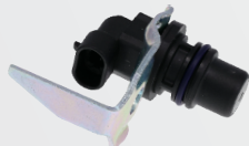
522-082 Camshaft Position Sensor