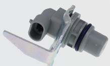
522-076 Camshaft Position Sensor