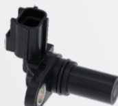
522-077 Crankshaft Position Sensor