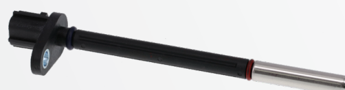
522-078 Camshaft Position Sensor