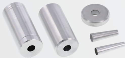
GBTK-001 Premium GDI Seal Tool Kit