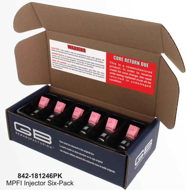
842-181246PK MPFI Injector Six-Pack

GB Reman has the most complete fuel injection program available in the automotive aftermarket. GB Reman's complete line of fuel injectors are remanufactured in the USA, 100% tested to meet or exceed OEM specifications and backed by GB Reman's industry-leading 24-month unlimited mileage warranty.